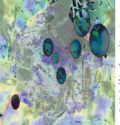
Space Kenii Siratori